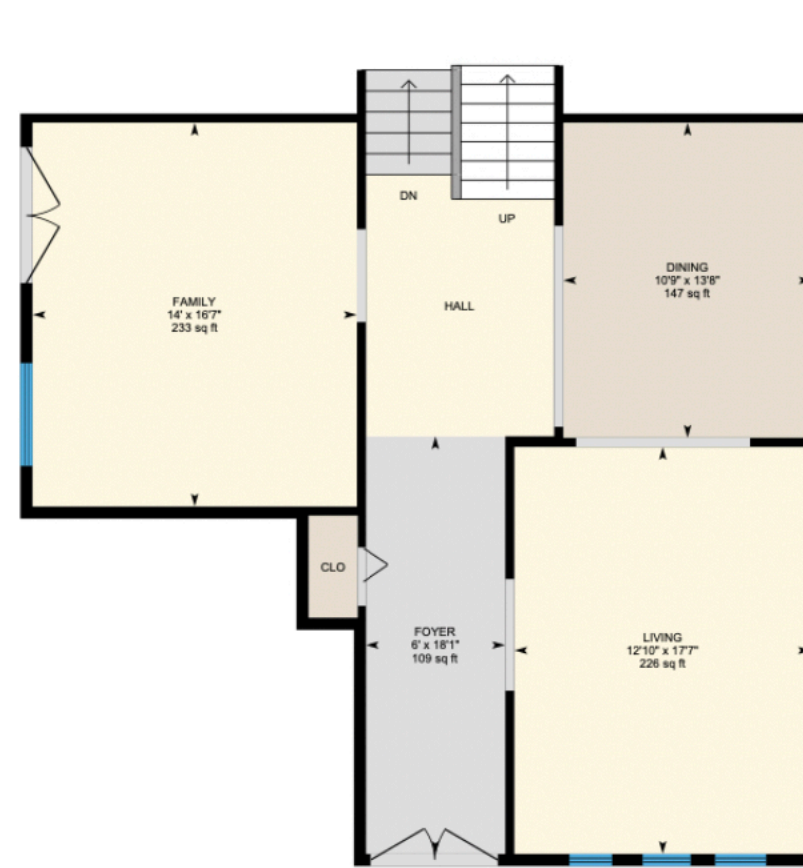
Main Floor Exterior Area 912.90 sq ft