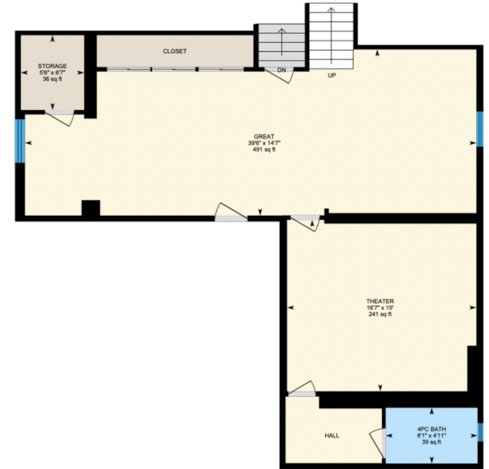
1st Floor Exterior Area 1033.76 sq ft