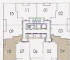
5th to 40th Floor

All furniture and images are artist's concept. Specifications, terms and conditions are subject to change without notice. All options shown are upgrades. The measurements adhere to the rules and regulations of the TARION Warranty Corporation's official method for the calculation of the floor area. Actual usable floor space may vary from the stated one. E. & O.E. May 2018